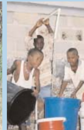
The community chips in to help paint the school buildings; children carry new supplies back to their homes; water buckets are filled from the newly dug wells.

Community building brings self sufficiency, conquers poverty, and brings HOPE.