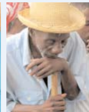
Volunteers provide much appreciated medical help for little ones. Faces of the elderly reveal sadness from a life of deprivation.